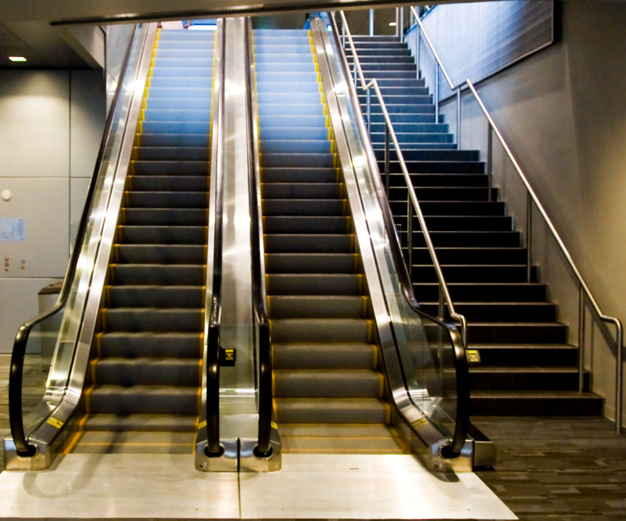
An elevator, set of escalators and stairs lead from Vancouver Convention Centre's Harbour Concourse up to the Burrard entrance foyer.

Level 1 West Pacific Terrace West Exhibition Level Access