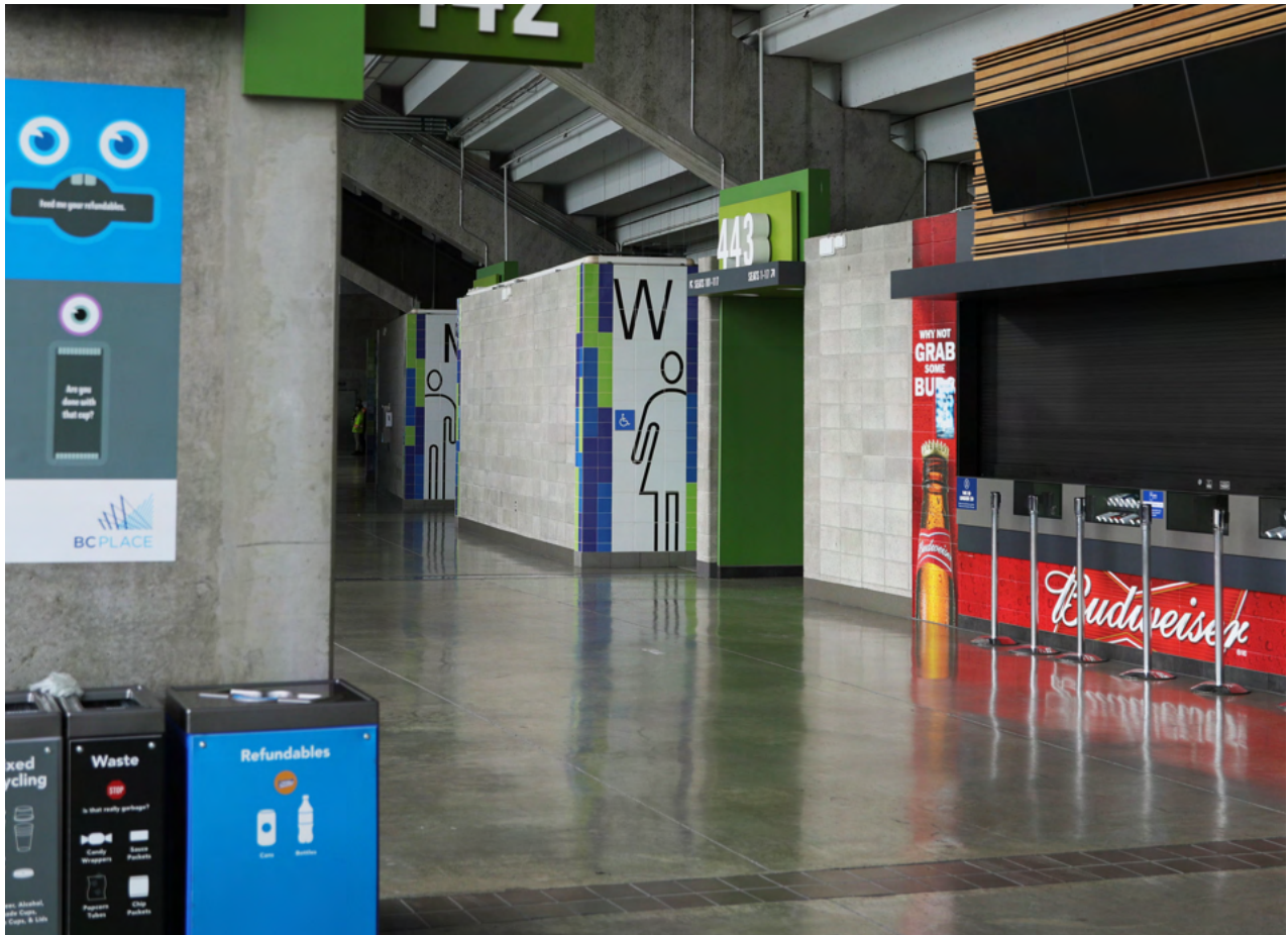
Washrooms at BC Place