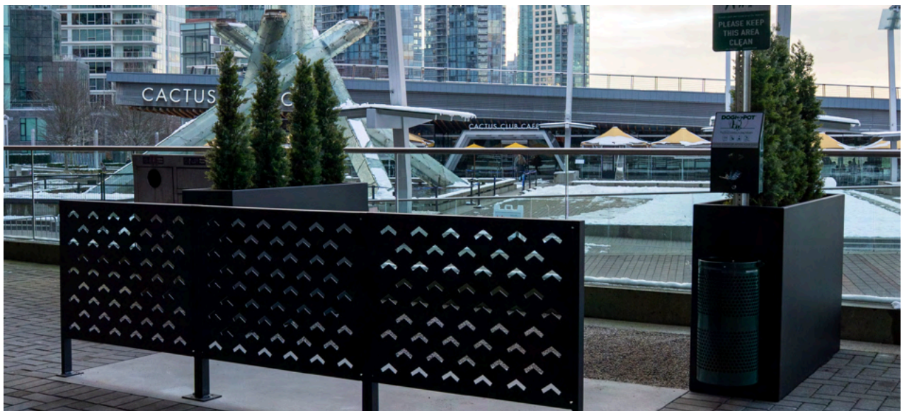
The animal relief station at the Vancouver Convention Centre is located on the Pacific Terrace, overlooking Jack Poole Plaza. The enclosed area includes a waste disposal receptacle and provides a designated space for guests and their pets.

At BC Place, stadium policy allows attendees with service animals to leave and re-enter the stadium if they need to relieve their animals.