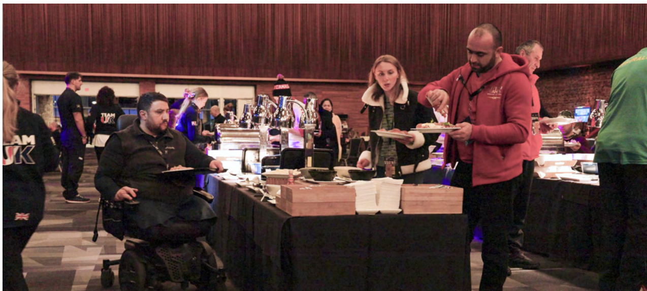
Food stations during the Invictus Games Vancouver Whistler 2025 provided accessible access to buffets