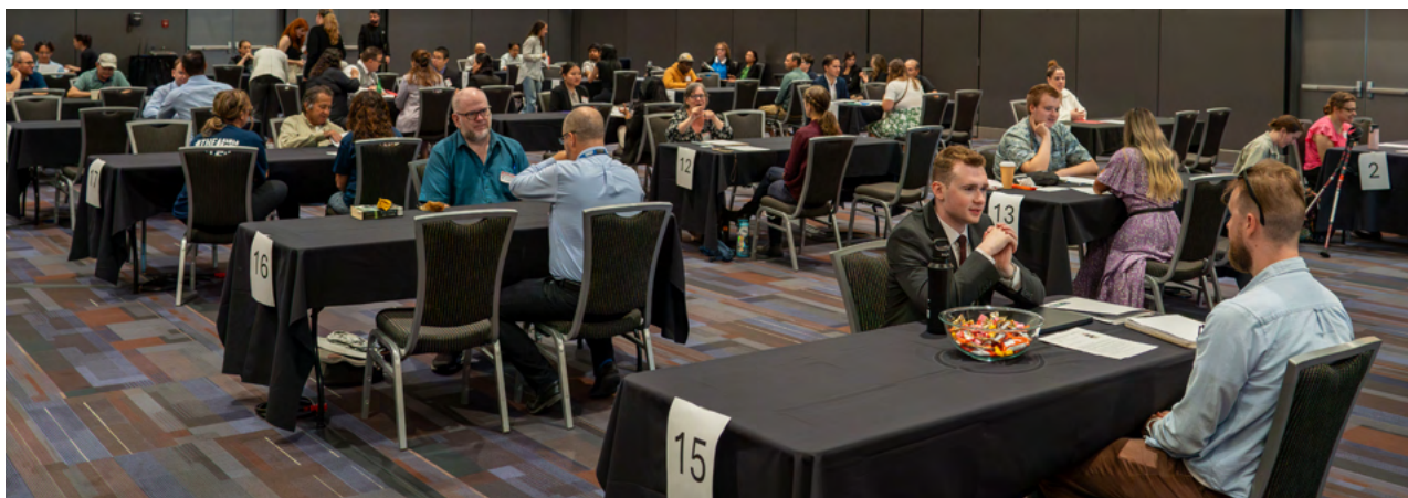
The Reverse Job Fair, held at the Vancouver Convention Centre East. The job fair - where employers rotated through the event, visiting job seekers, rather than the other way around - ensures opportunities are accessible and inclusive to all job seekers.