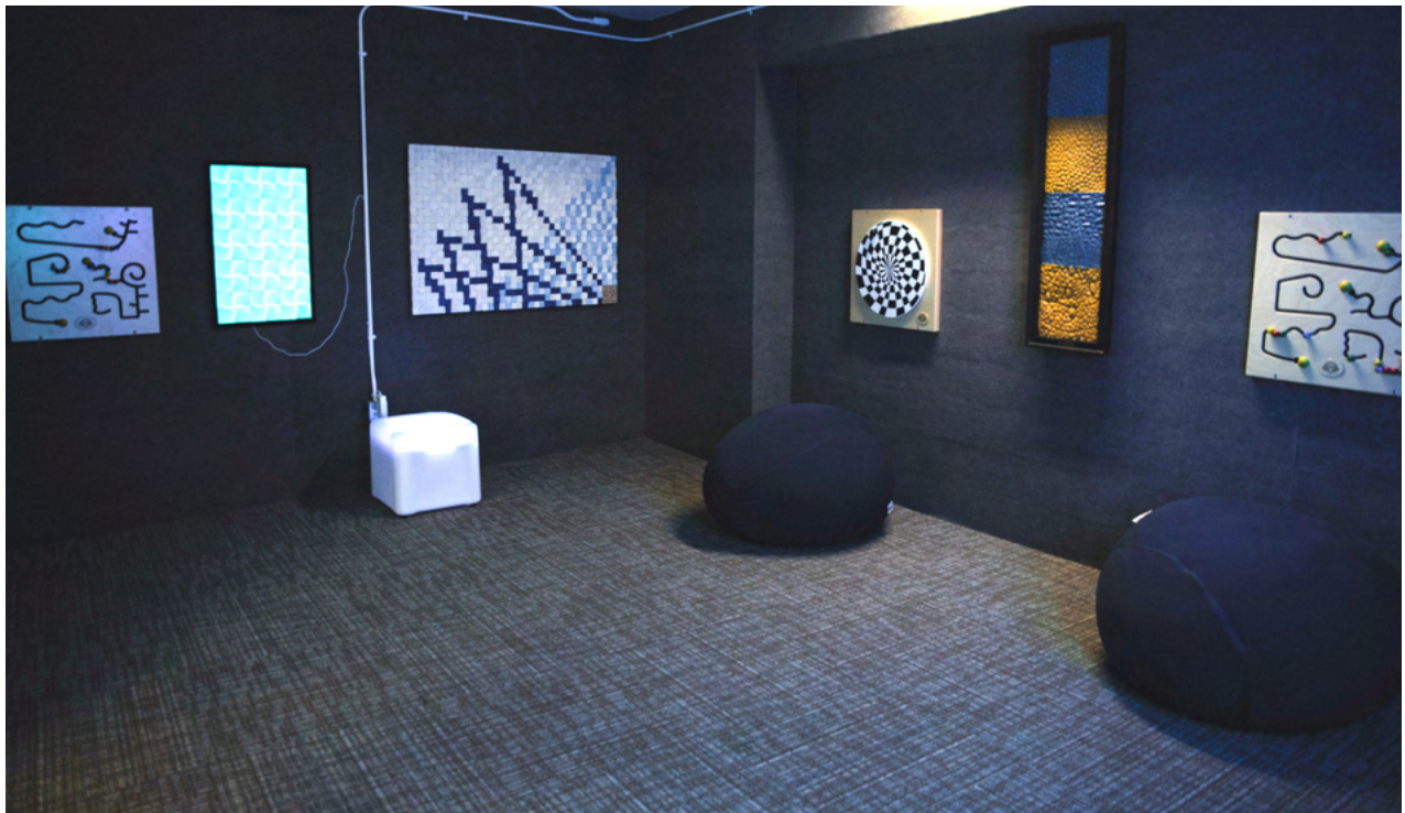
A sensory room at BC Place