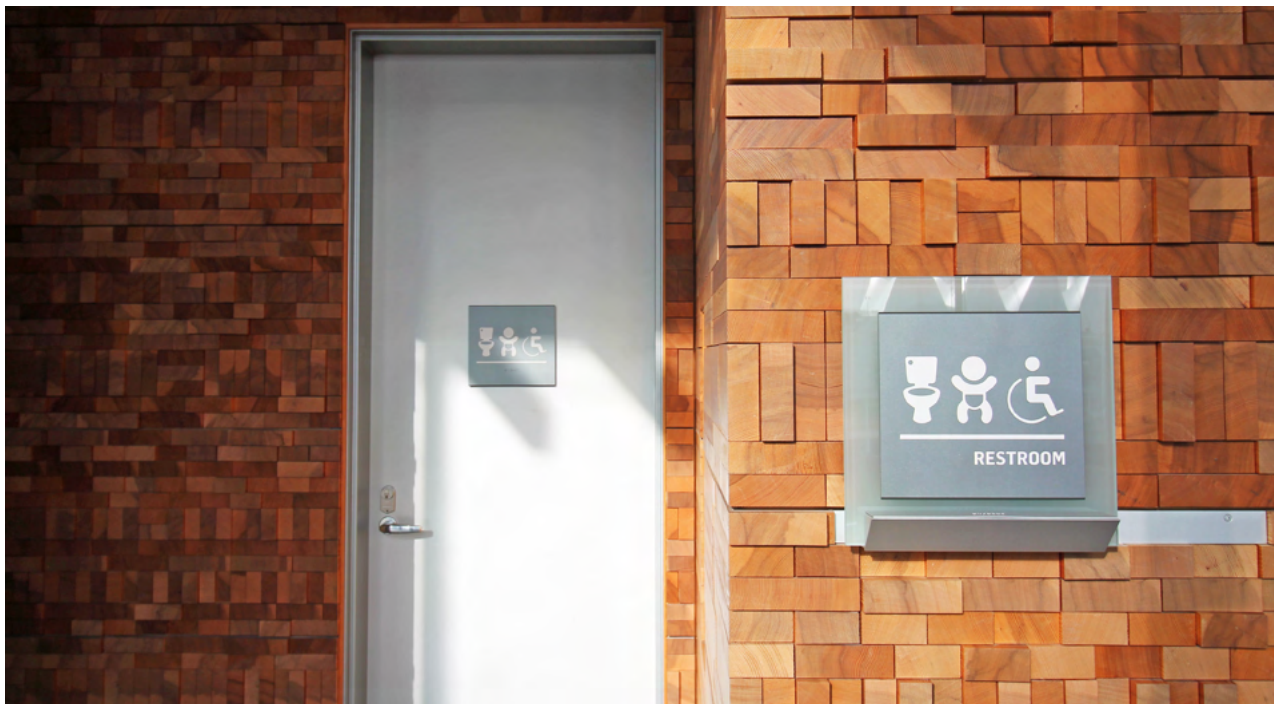
An accessible washroom at the Vancouver Convention Centre West