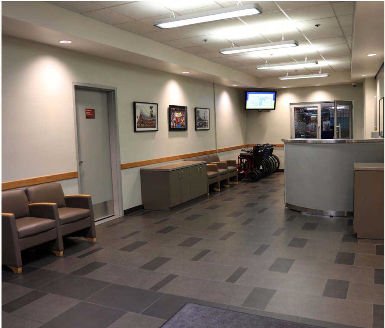
Accessible entrance at BC Place