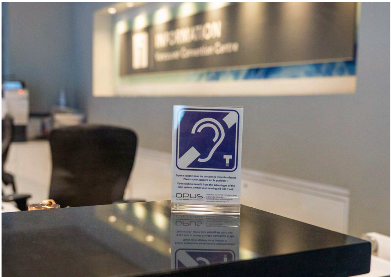
A sign at the Vancouver Convention Centre West Information Desk shows that hearing loops are installed in this location.

In early 2025, the Vancouver Convention Centre and BC Place integrated hearing loop technology at various locations within their facilities, including Guest Services areas, Control Rooms and Information Desks. This loop technology helps people with hearing challenges by amplifying the sounds of the person they are interacting with during a one-on-one conversation.