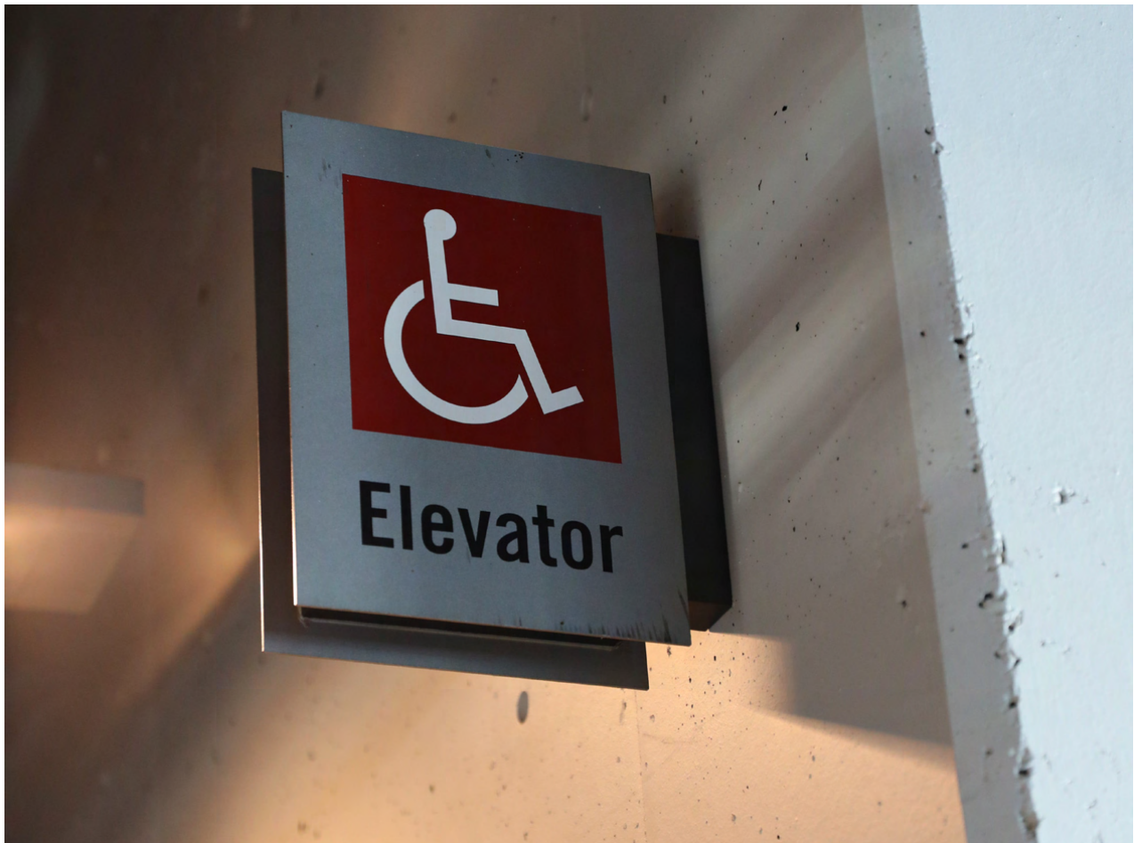
Accessible signage for elevators at BC Place