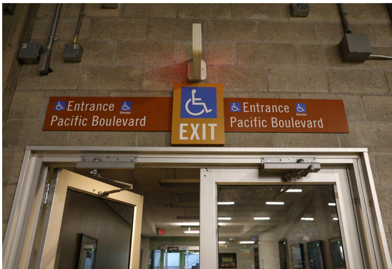
Accessible entry at BC Place