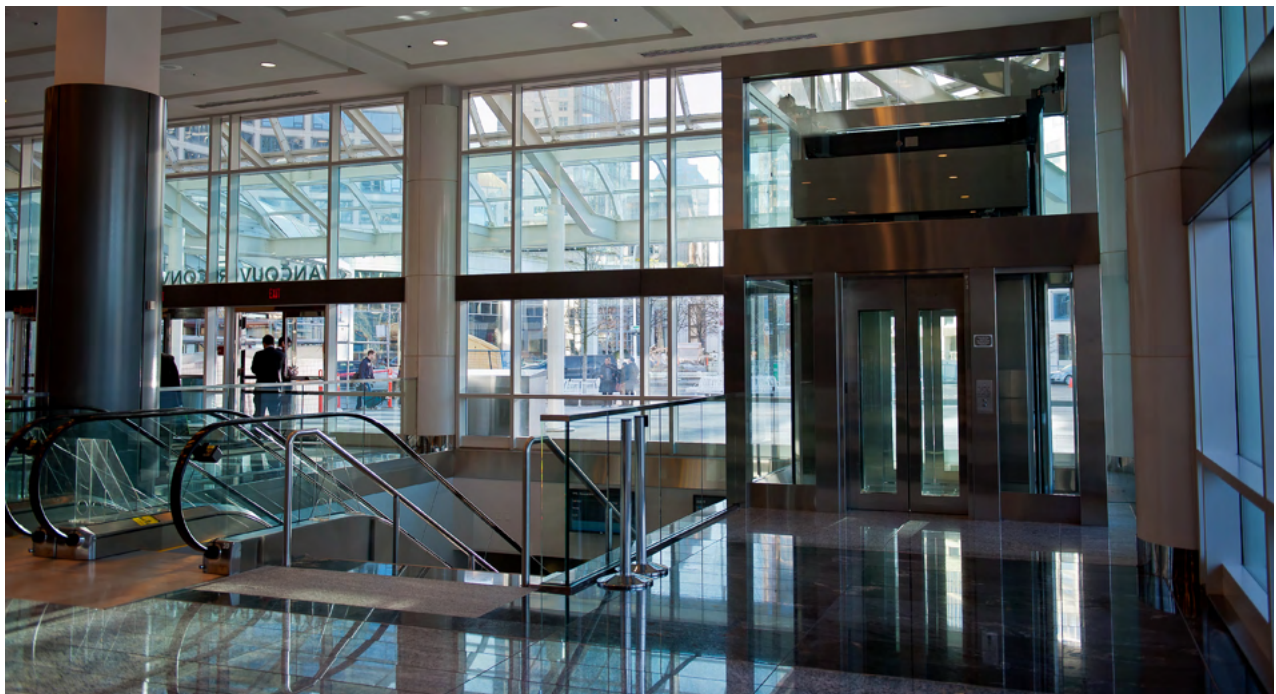
Elevators in the Vancouver Convention Centre East lobby