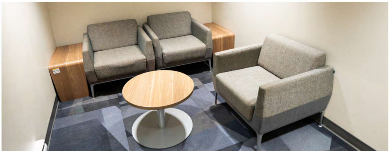
A quiet room at the Vancouver Convention Centre West