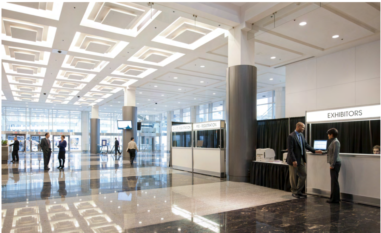
Vancouver Convention Centre East lobby