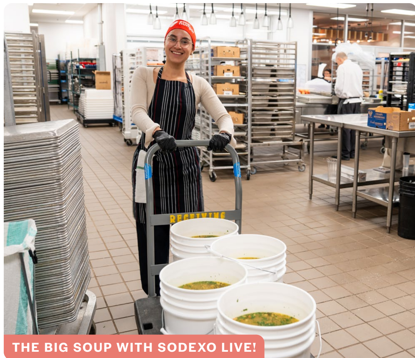
THE BIG SOUP WITH SODEXO LIVE!