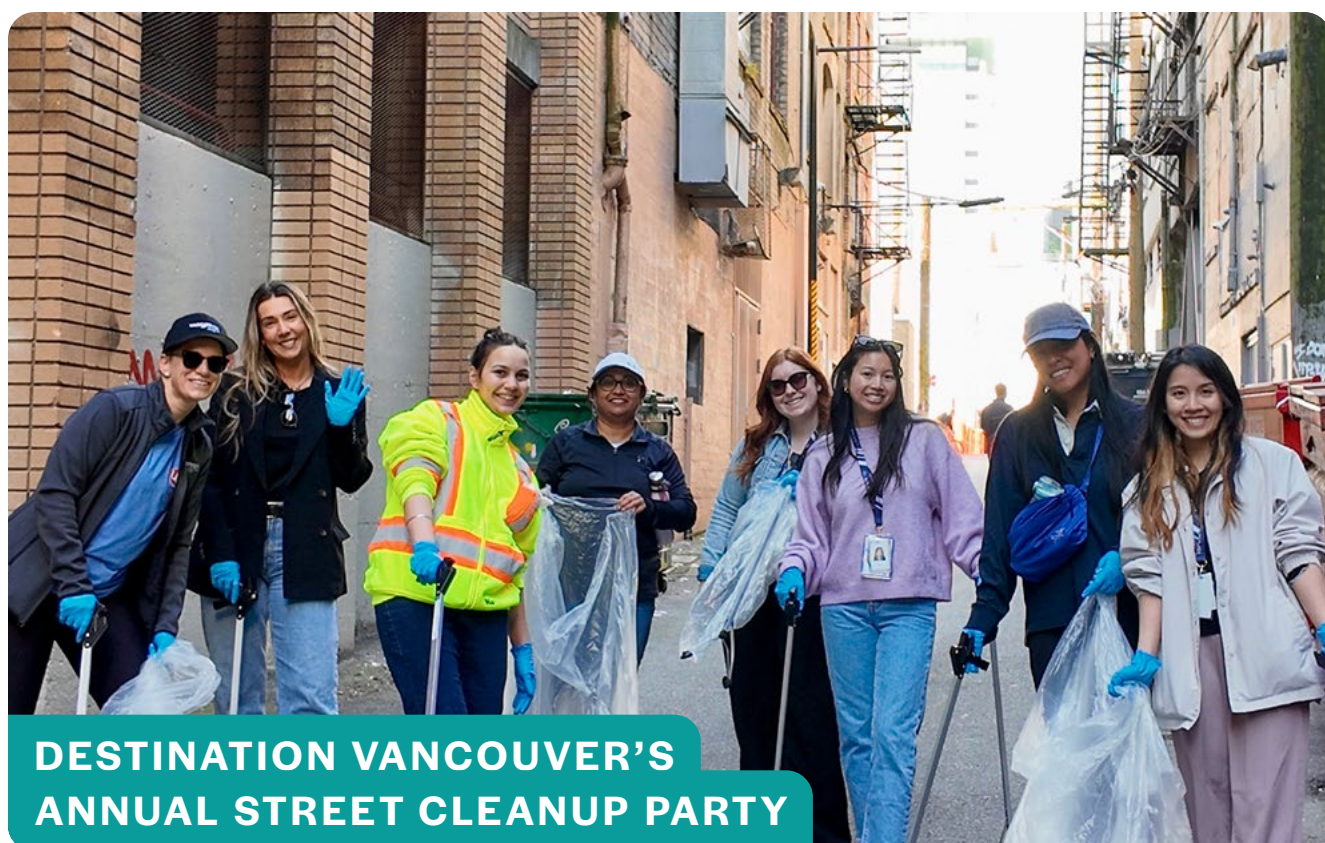
DESTINATION VANCOUVER'S ANNUAL STREET CLEANUP PARTY