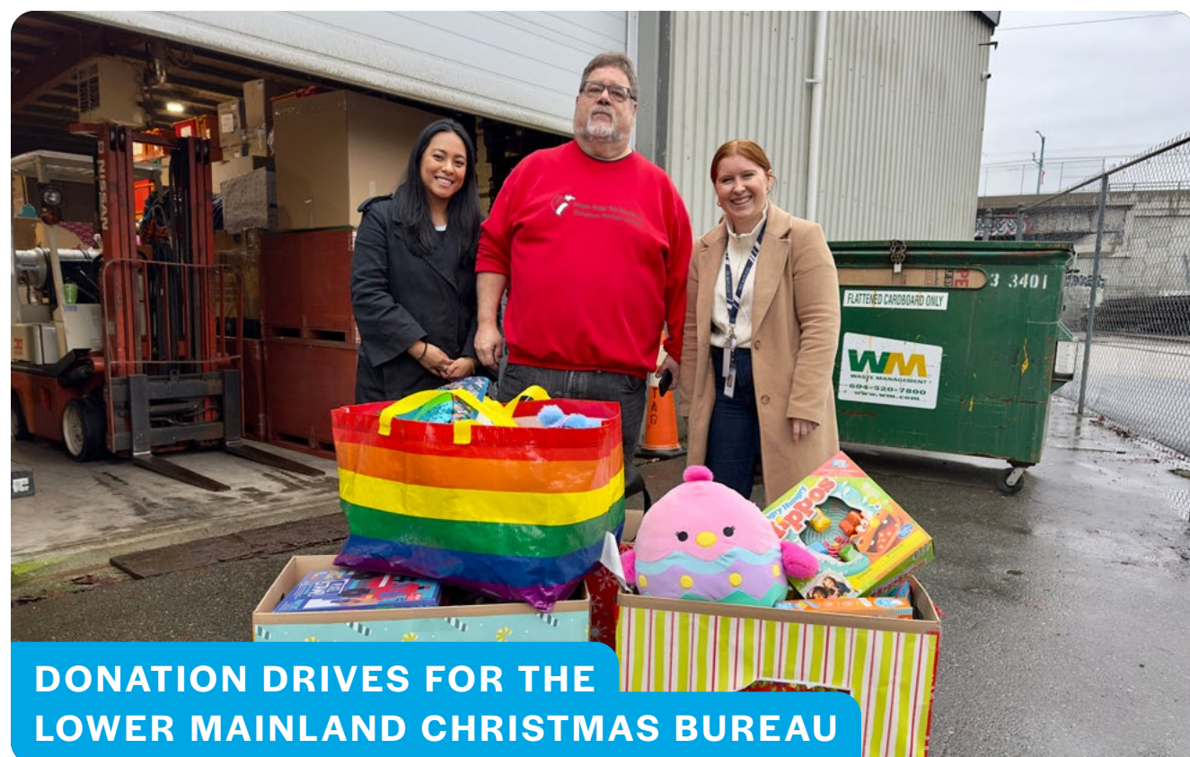
DONATION DRIVES FOR THE LOWER MAINLAND CHRISTMAS BUREAU