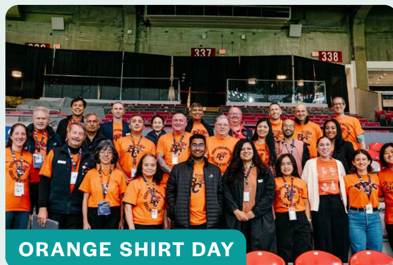
ORANGE SHIRT DAY