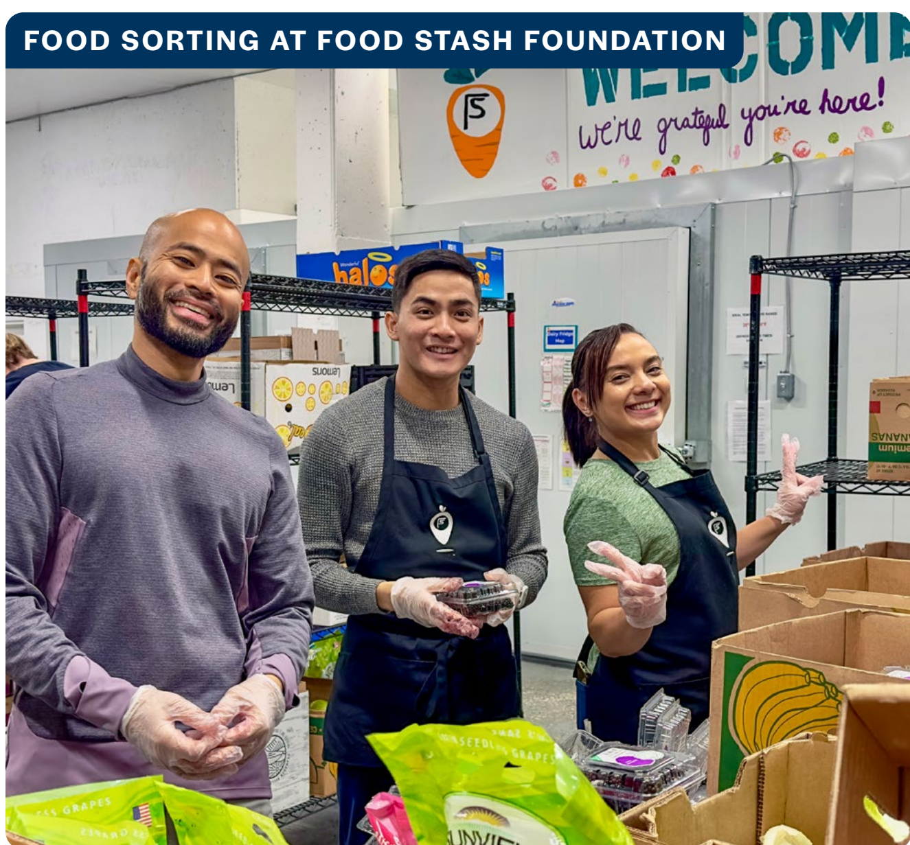
FOOD SORTING AT FOOD STASH FOUNDATION

PavCo's work to support community members is strengthened by the dedication of our team members who actively engage in our educational and volunteer initiatives. Their contributions reflect our shared commitment to fostering inclusive spaces and creating meaningful community benefit for British Columbians.