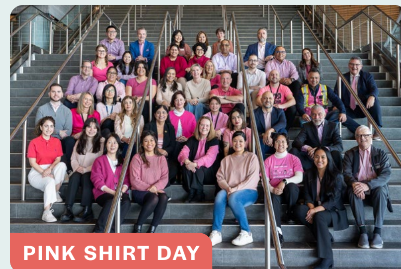
PINK SHIRT DAY