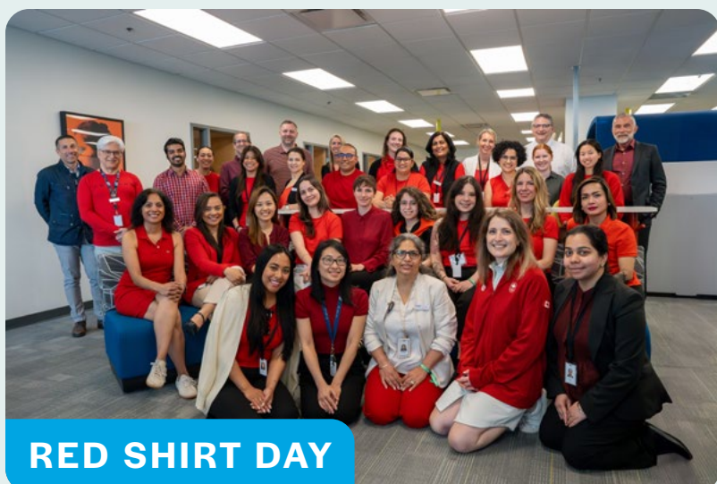
RED SHIRT DAY

Recognizing diverse days of significance across the organization, including cultural and religious holidays and inclusion-focused observances such as: